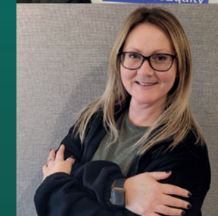
International Womens Day.