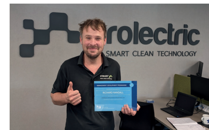
We provide extensive manual handling, health & safety and vehicle drivers training under several schemes, including the Construction Skills Certification Scheme (CSCS), the Site Supervisors Safety Training Scheme (SSSTS) and Mobile Elevating Platforms Health & Safety Training (MEWP).

We support employees' physical and mental well-being through facilities and services. Employee assistance programs and support are provided, even in the event of employment termination.