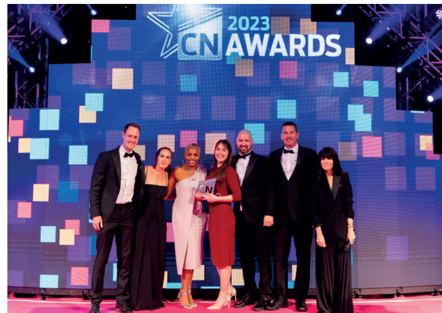
Prolectric won the Carbon Reduction Champions award at the 2023 Construction News Awards.

We're proud to support the Bristol Volksfest in North Somerset. Our Prolight Solar Lighting Towers were on-site over the two-day festival providing sustainable solar lighting.