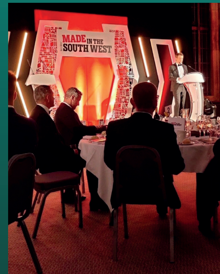
The South West awards. Prolectric are shortlisted for three awards tonight - Manufacturing Innovation, Sustainable Contribution, and Manufacturer of the Year!

In late 2022, we received an Award for Innovation and Technology from AMPS (The Association of Manufacturers of Power Systems). Our Solar Hybrid generator, the ProPower, was singled out for its innovative use of solar, battery and hybrid technology in a single, trailer-mounted unit. We've also received among other awards and recognitions, a Green Apple Award for Environmental Carbon Reduction in 2019.